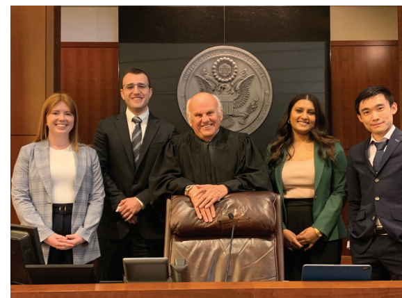
RIGHT 2025 Coughenour Competition teams with Judge Coughenour in his courtroom

55 TOTAL STUDENTS ENROLLED IN TRIAL ADVOCACY CLASSES (TA1 & TA2)